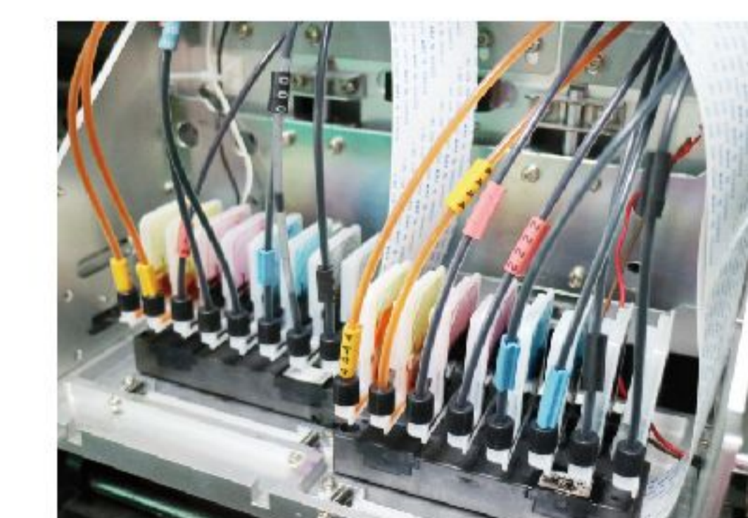
User Friendly Mechanical Design