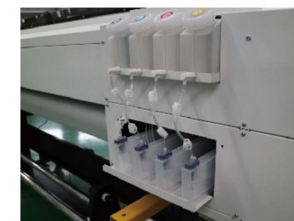
Stable Bulk System Ensures Amazing Printing Speed