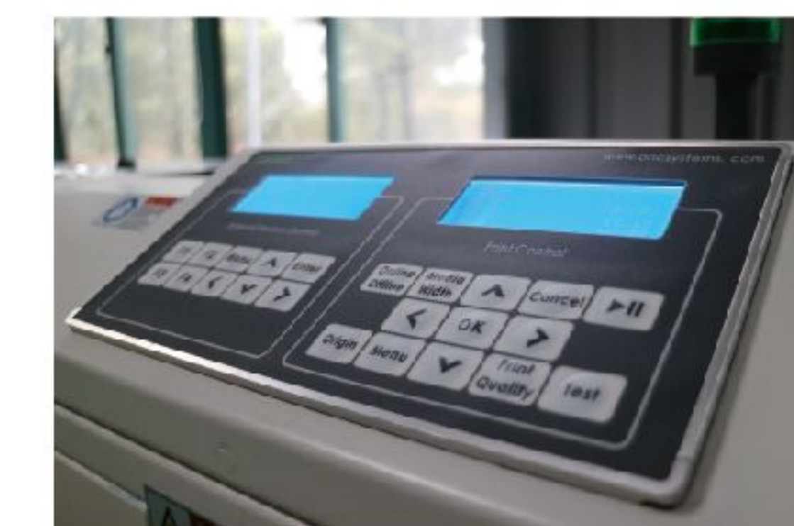
User Friendly Mechanical Design