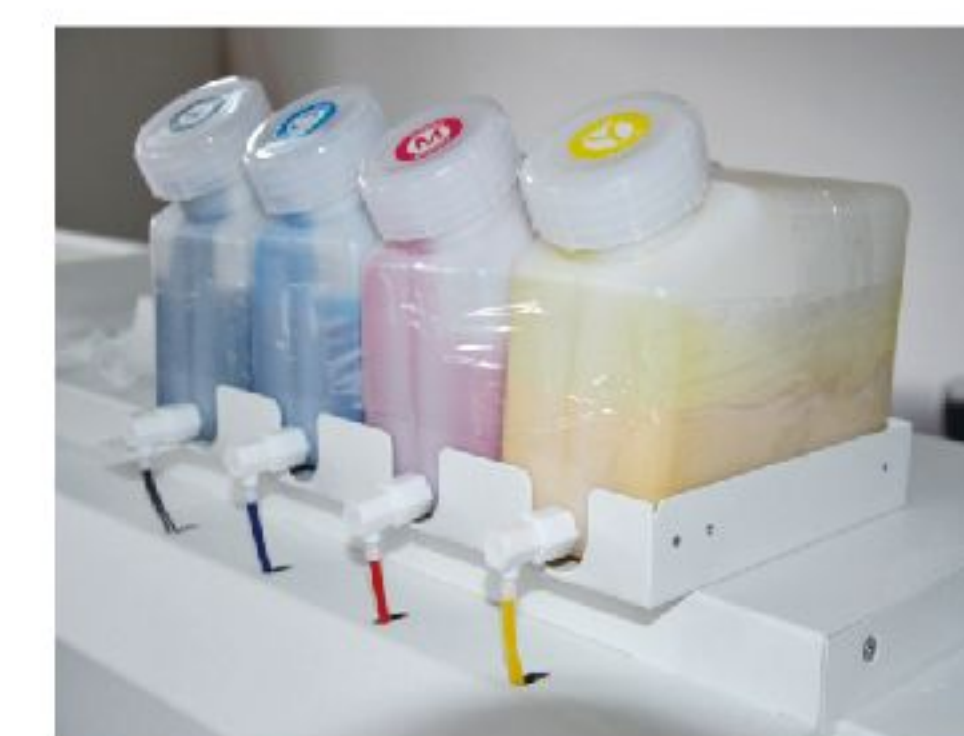
Stable Bulk System Ensures Amazing Printing Speed