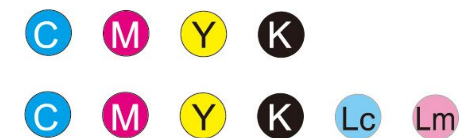
Various Color Configuration for Perfect Output