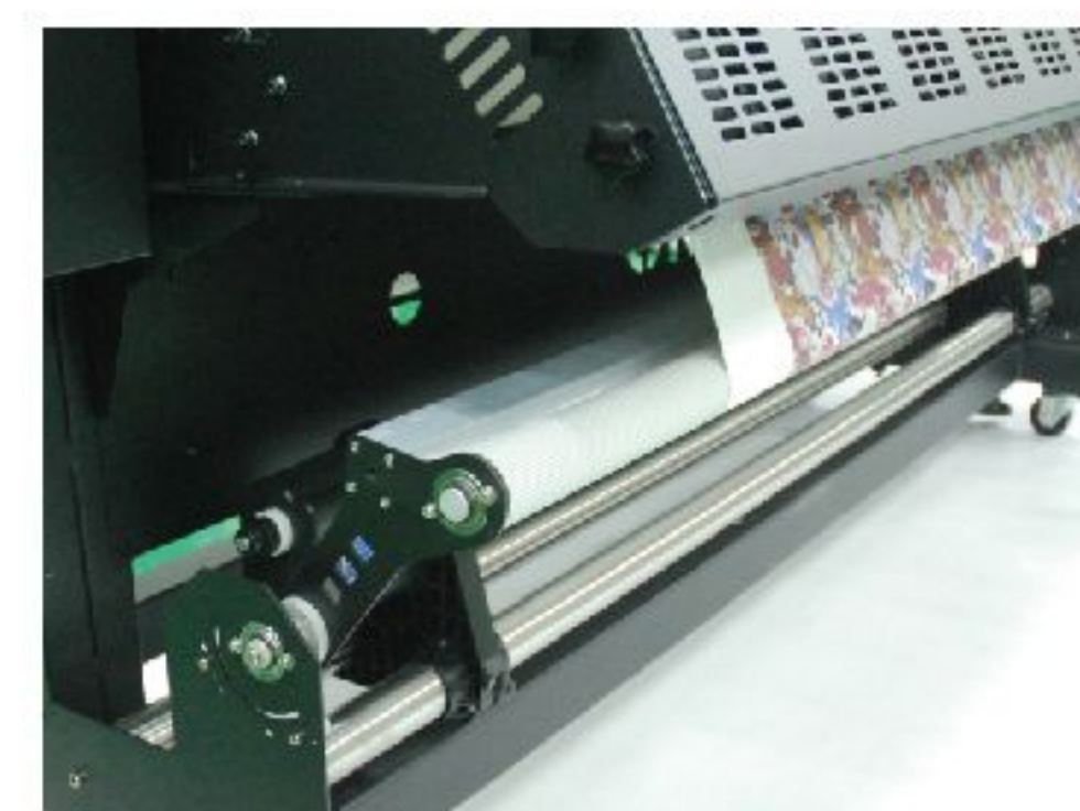
Perfect Media Feed & Roll System