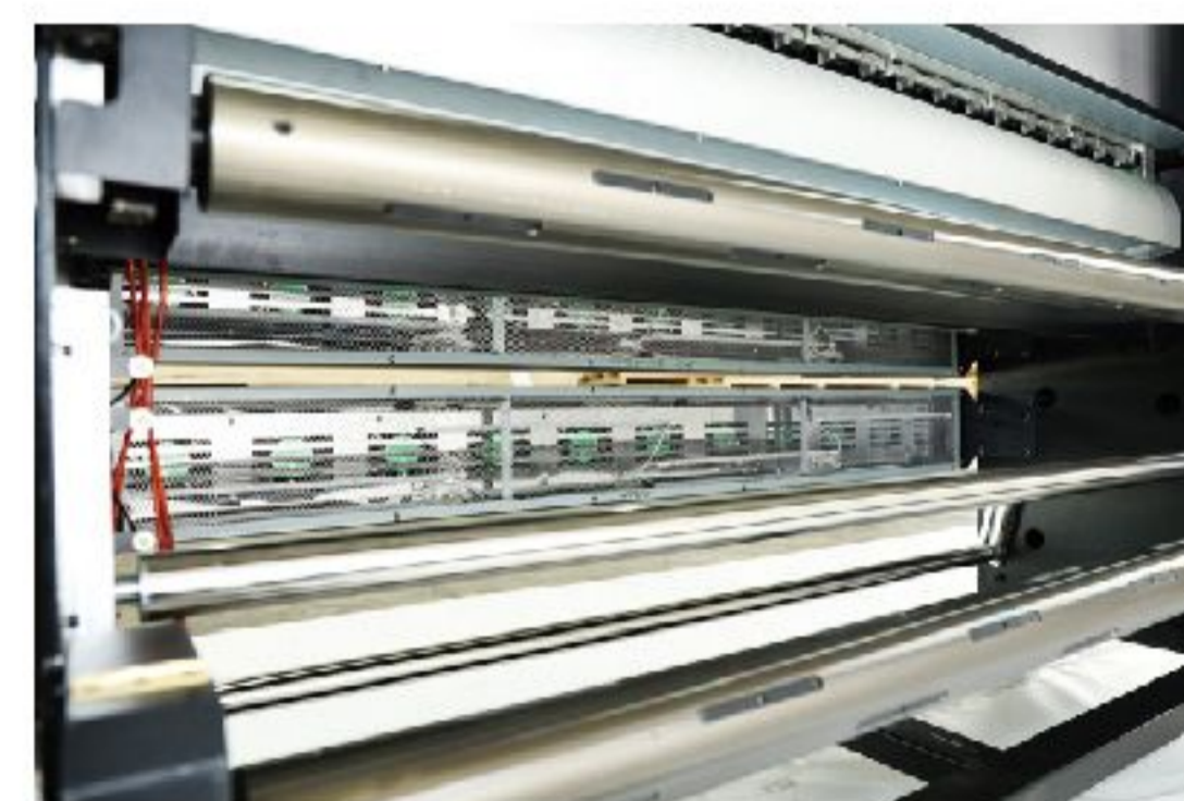
Inflatable take up and feed media shaft