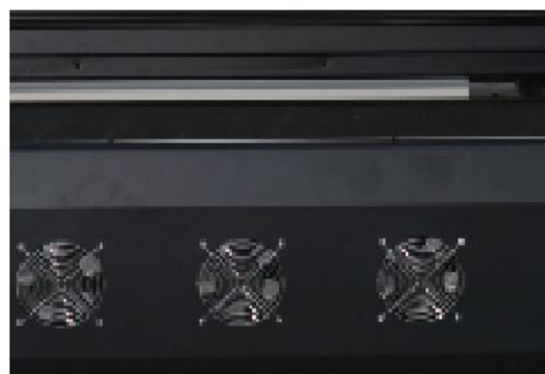
Integrated IR & cooling fan system