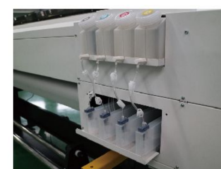
Stable Bulk System Ensures Amazing Printing Speed