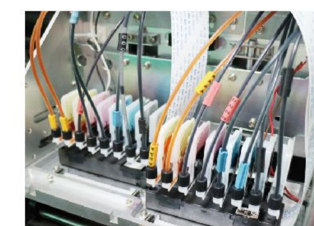
User Friendly Mechanical Design