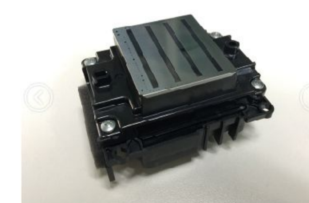
The New EPS3200 Print Head