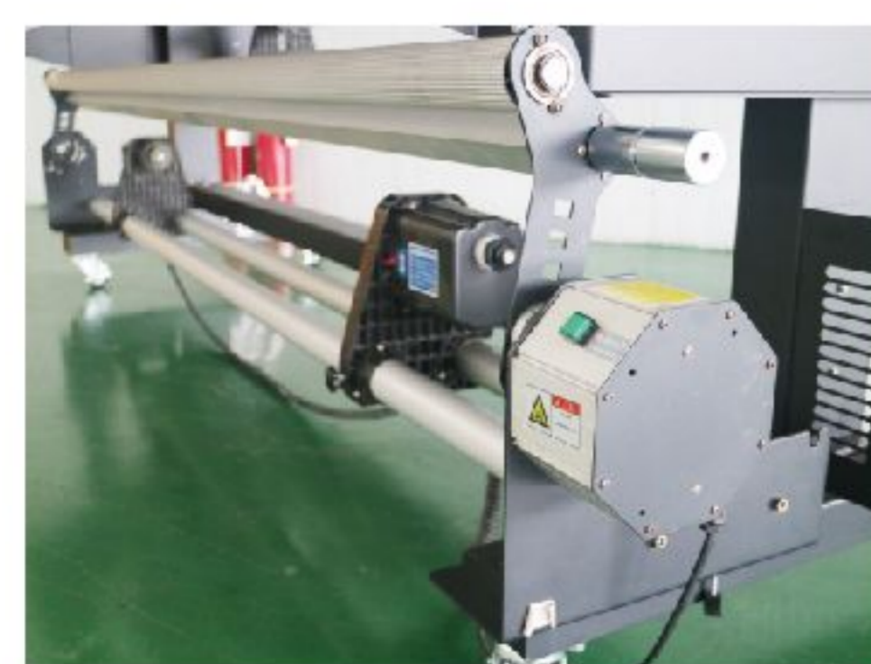
Tension Take Up System