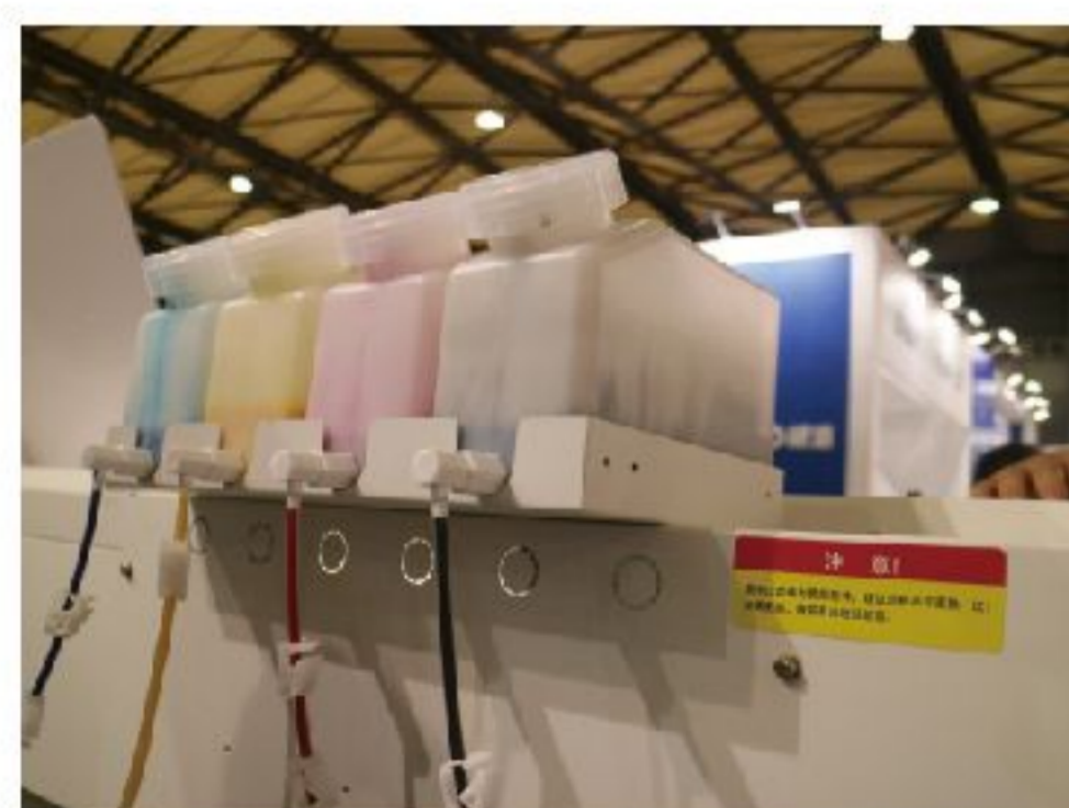
Stable Bulk System Ensures Amazing Printing Speed