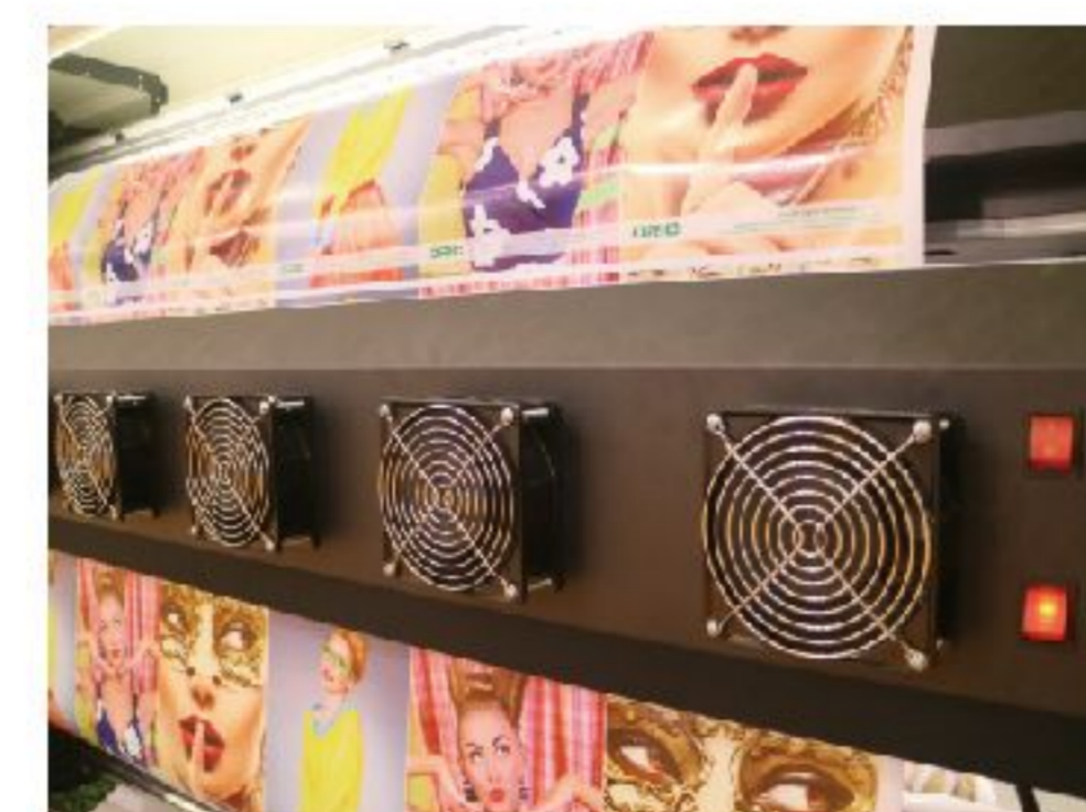
User Friendly Mechanical Design