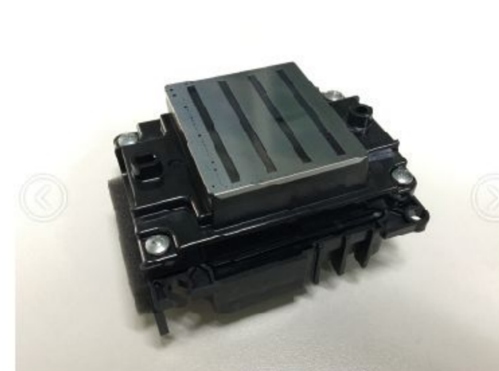
The New EPS3200 Print Head