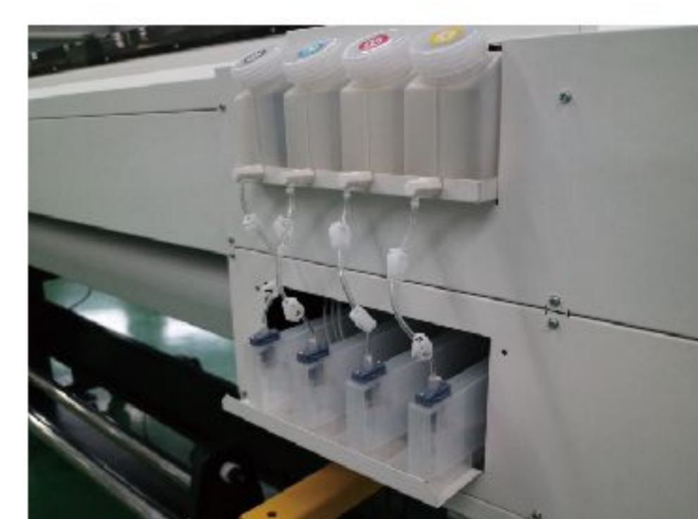
Stable Bulk System Ensures Amazing Printing Speed